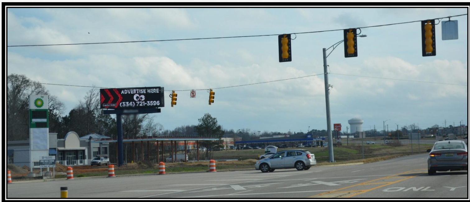
Chantilly Parkway at Eastchase Parkway Facing North for Southbound Traffic