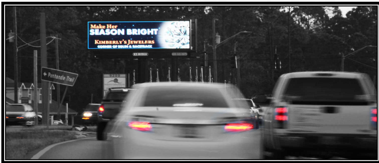
Hwy 98 @ Panhandle Trail Dr Facing West for Eastbound Traffic