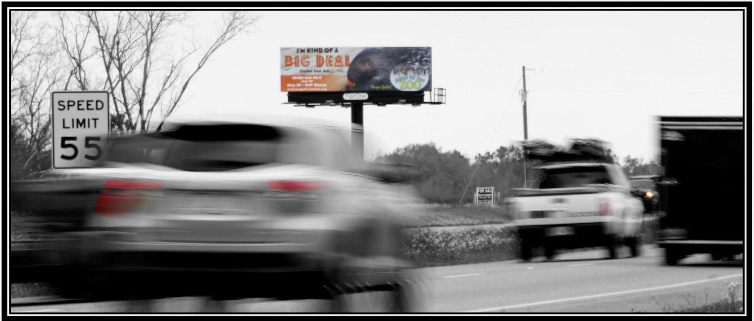
Baldwin Beach Expressway/CO RD 32 Cross read for Southbound traffic