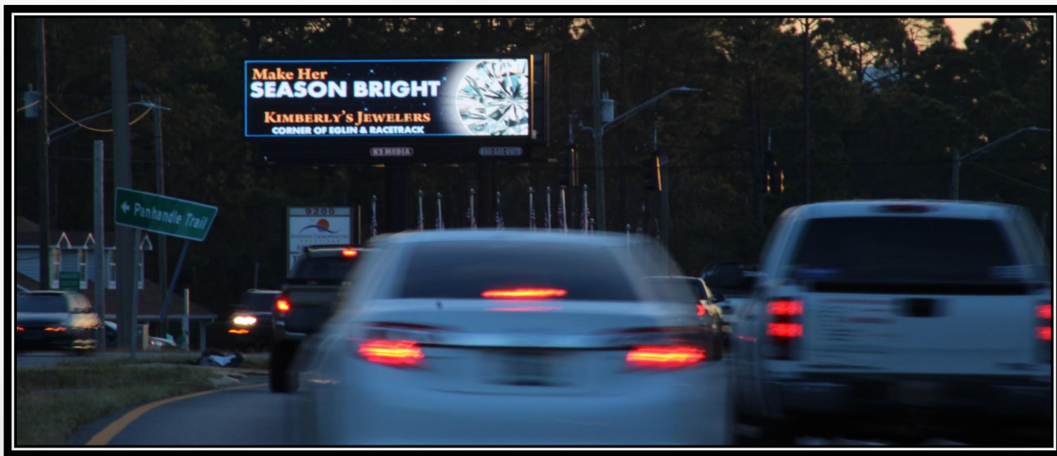
Hwy 98 @ Panhandle Trail Dr Facing West for Eastbound Traffic