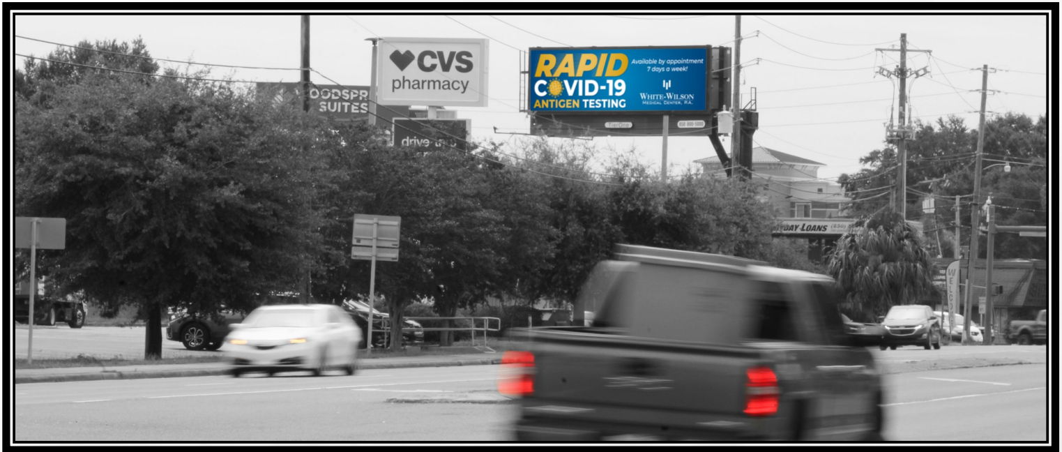
Racetrack Road @ Eglin Pkwy Facing West for Eastbound Traffic